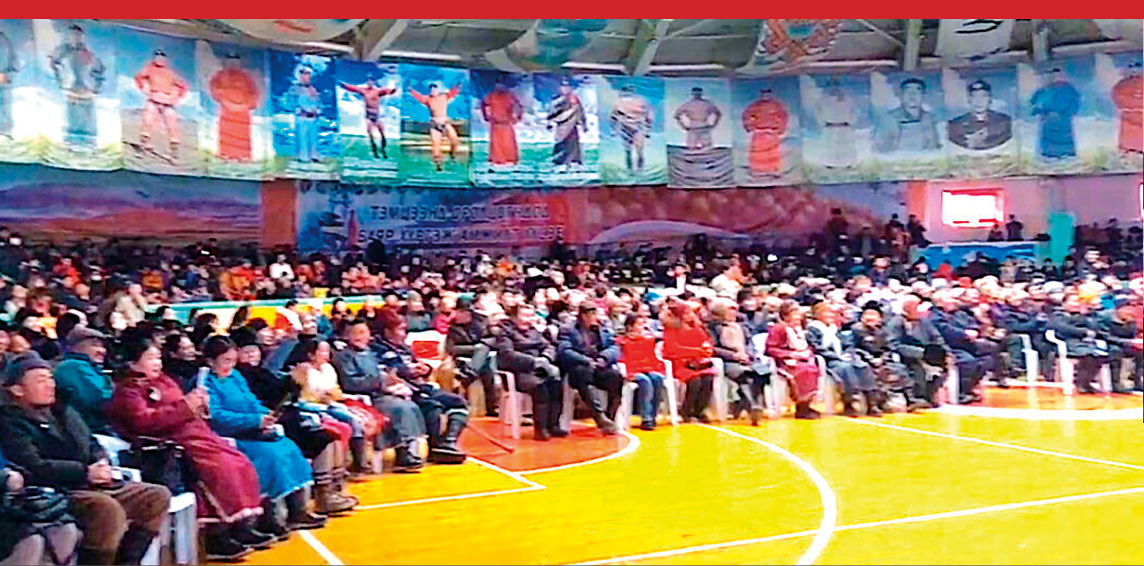
A large evangelism event in Uvs province